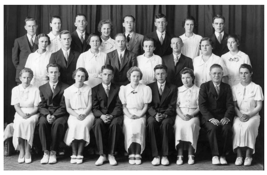
80 years ago 1935-36