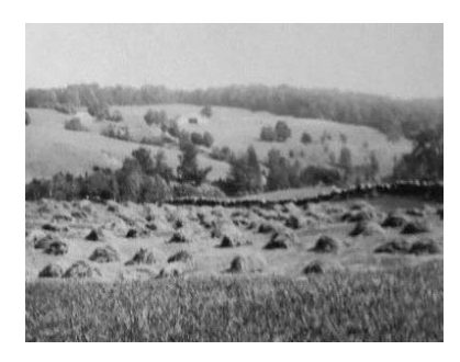
Haying in Groton about 1900