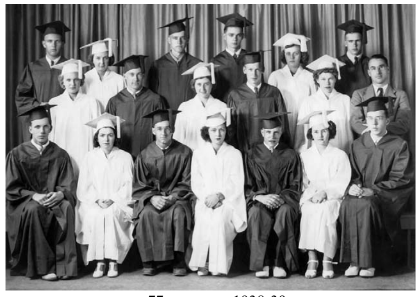
77 years ago 1938-39