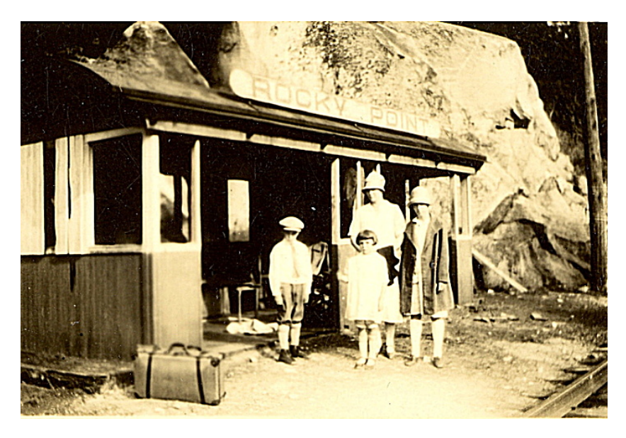
Rocky Point RR stop at Groton Pond