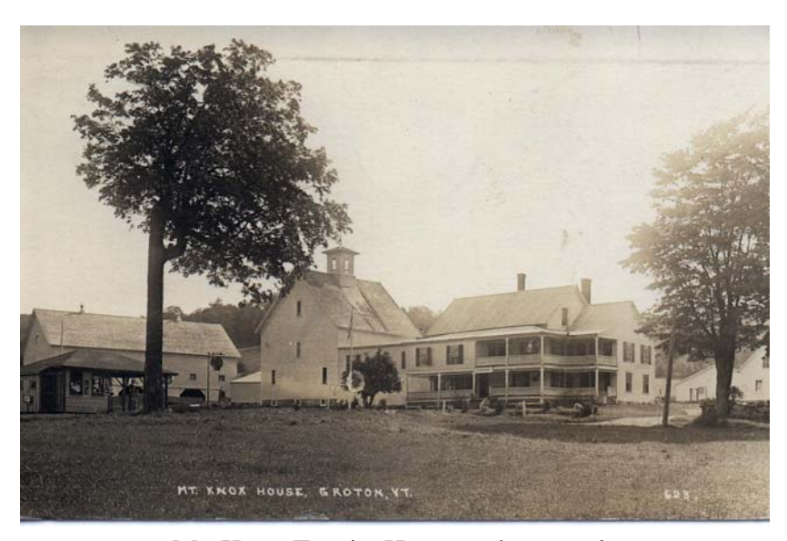
Mt. Knox Tourist Home and gas station