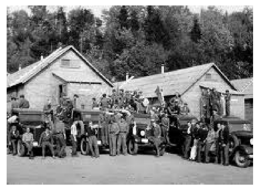
Typical CCC enrollees getting ready for a work day