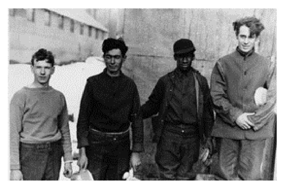
CCC Enrollees at Groton State Forest