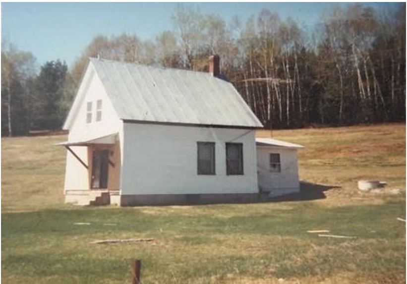
South schoolhouse on Powder Spring Road