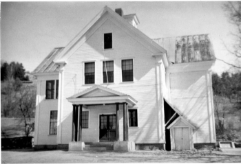
Groton School, Groton, VT, in 1957.